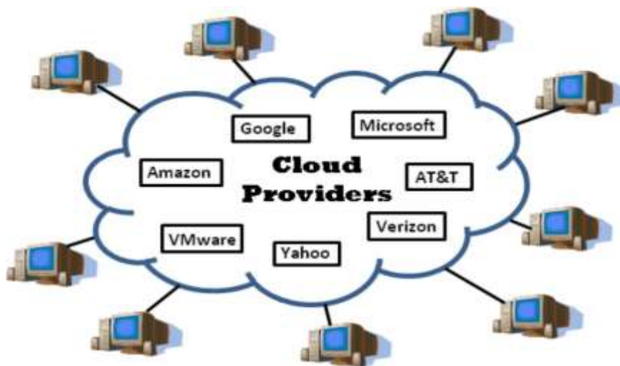
Figure 2: The Concept of Cloud Computing [Wiki11]

Cloud computing is a model for pooling IT resources to provide real-time, on-demand, self-provisioned services to business users on an as-needed basis. From the user's perspective, this model requires minimal management and interaction with IT staff, streamlined provisioning processes, and provides dramatic cost savings over traditional IT [Calheiros09]. On the back end, cloud computing requires the establishment of complex networking, storage, and server configurations that optimally are configured to be self-monitoring and self-healing. Clouds are self-monitoring in that they should be able to automatically balance workloads across physical assets during peak periods, while conversely decommissioning idle resources to conserve energy and reduce costs during non-peak periods. Clouds are self-healing in that the failure of any individual physical hardware or software component is remediated in the shortest possible time, and this implies rapid recovery even in the event of a complete datacenter outage.