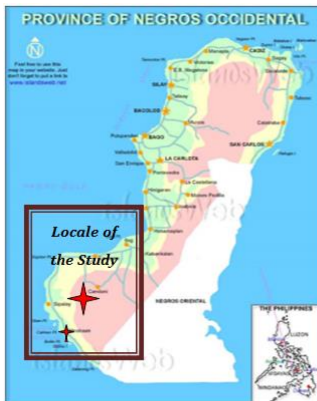
Figure 2: Map of Negros showing the Locale of the study

The research was conducted in selected secondary schools in Southern Negros, Division of Negros Occidental in Candoni, Cauayan, Ilog, Sipalay and Hinoba-an. (Figure 2)