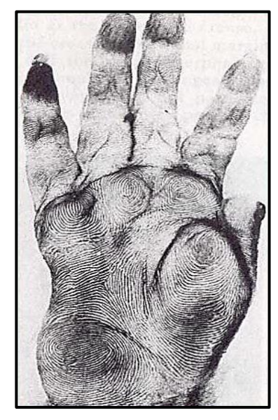
Figure 8 - A hypothenar whorl in the right hand of a macaque (macaca fascicularis), source: 'Dermatoglyphics: an international perspective', p.58 (Mavalwala, 1978). Picture Taken by https://handfacts.wordpress.com/2009/11/18/hands-five-major-differences-between-the-primate-hand-and-the-human-hand/

Notice - Whorl and loop patterns on the Mounts of Moon and Venus are rare in human hand, in the primate hand it is a common feature. From all available published statistics, there appears to be very high occurrence of whorl patterns on the hands of mental patients.