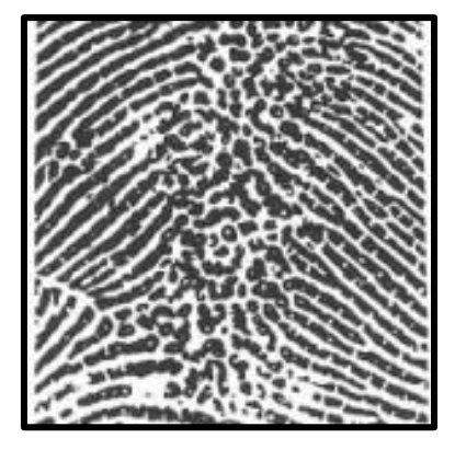
Figure 5 - Dissociated ridges

Palmar ridge dissociation (broken skin ridges) was found in most hands of criminals.