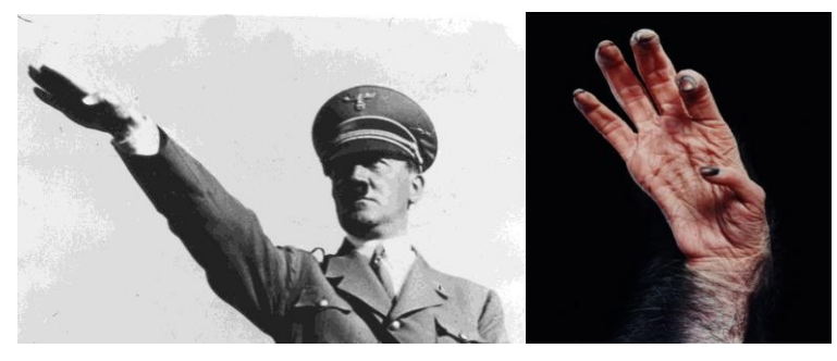
Figure 1 – Hitler's hand

Most of the criminals were found with longer palm than their fingers. And also low set thumb. These aspects denote the violent and aggressive nature. Also this aspect can be seen on chimpanzee's hand.