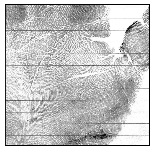
Figure 7 – whorl pattern on the mount of Venus

International Journal of Social Science and Humanities Research ISSN 2348-3164 (online) Vol. 4, Issue 2, pp: (427-434), Month: April - June 2016, Available at: <u>www.researchpublish.com</u>