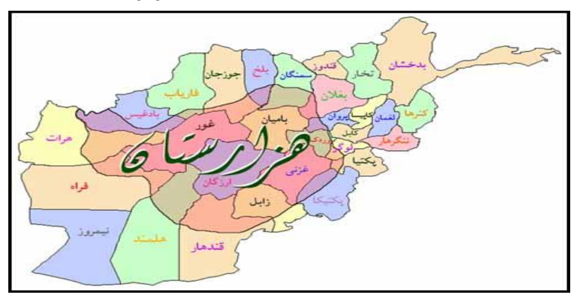
Fig. 1. Afghanistan and the geographical area of Hazarajat in 1890. Mousavi 1998:101.