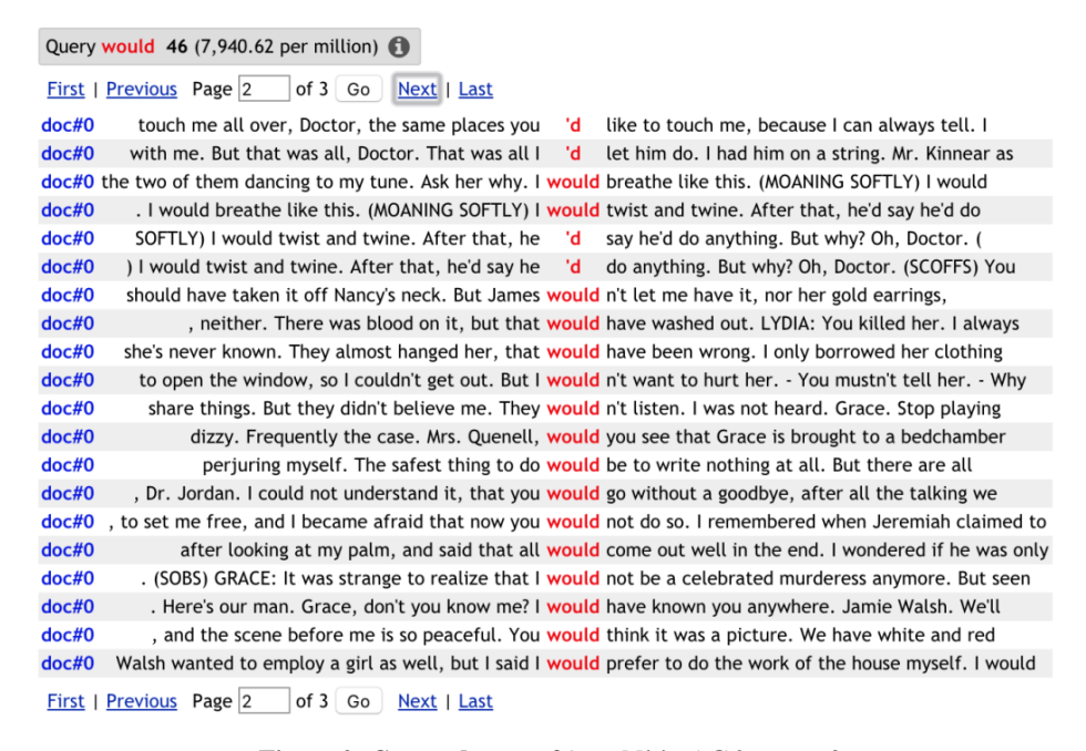
Figure 2: Concordances of 'would' in AG6 – page 2

Figure 2 lists the second Sketch Engine video display of concordances with 'would' in AG6. Four text samples have been extracted from this to also include co-text (Table 4).