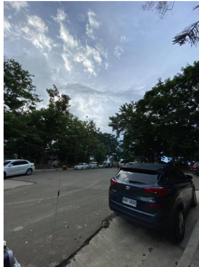
Figure 8: The Lack of Parking Marks for Parking Spaces can be a confusion among the guest

When it comes to inclusive tourism the aspect of parking is considered one of the important according to Villamayor (2019) parking is very important because it shows the accessibility of the guest towards a tourism provider whether it is an accommodation, food and attraction following the guidelines on parking shows that the tourist site is very accessible because of the availability of parking which is very important nowadays as more cars were used.