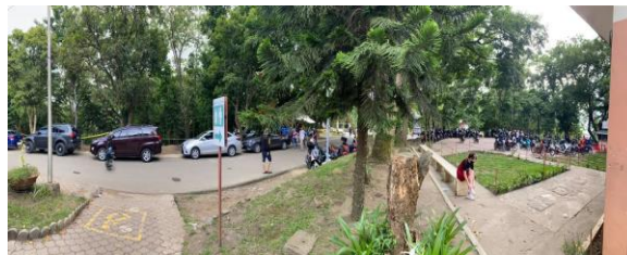
Figure 2: Pathways are wide enough however there is a lack of handrails and railings

According to Linaja and colleagues (2020) crosswalks are very important in order to minimize accidents that it could cause to potential customers in the case of the study the tourist crosswalks are very important because this indicates the right place to cross a street with the purpose of minimizing accidents due to vehicles travelling on the road.