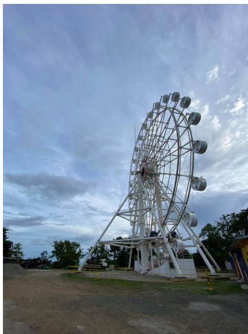
Figure 6: The Park had a lot of recreation available such as playground and a Ferris wheel in the sample photo

According to Linaja and colleagues (2020) the importance of putting a bike storage is that it helps to reduce the parking of cars by providing alternative option aside from that there is a growing trend when it comes to the used of bike which is very suitable to the site since it is a public park.