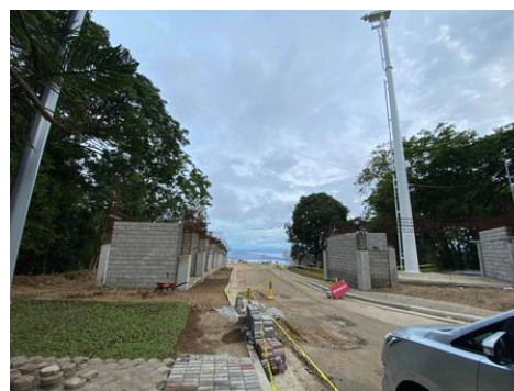
Figure 9: The Park is well lit and the lightning projects are ongoing including new post

The aspect of lightning when it comes to inclusive tourism plays a crucial role in which it provides a safe environment and consideration towards guest that have a poor eyesight. The table above shows the result of the lightning aspect of the inclusive tourism the result shows that all of the lightning guidelines have been followed in Picnic Grove although that the park at night does not have sufficient ambient lightning the current repairs and installation of lightning post would comply the Picnic Grove when it comes to the lightning aspect of Inclusive Tourism.