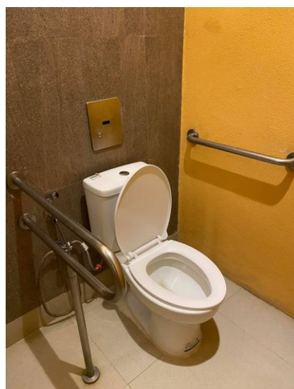
Figure 4: The restroom follows all the guidelines when it comes to inclusive tourism all the objects are reachable and there is handlebars present and can accommodate wheelchair

According to Villamayor and colleagues (2019) the restroom guidelines when it comes to inclusive tourism should be the one that given an importance because guest with special needs have a hard time accessing comfort rooms due to a lot of issues present however in the case of the Picnic Grove the management have carefully reconsider the possibility of guest with special needs by providing hand bars and the outward mechanism of comfort rooms.