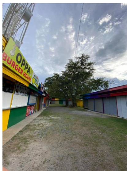
Figure 5: The Food Service area complies with the standards however due to the ongoing pandemic seating in the food service area is not allowed

According to UNWTO (2018) food establishments should provide a more standard services to different kinds of guest either normal or with special needs however this has been looked at specially when it comes to food establishment because many food establishment are not aware of inclusive tourism and does not pay attention that there is a standard when it comes to food retail and services thus this creates a lack of stakeholder participation with the sector members of PWD, Senior and Pregnant Women (Tan, 2018).