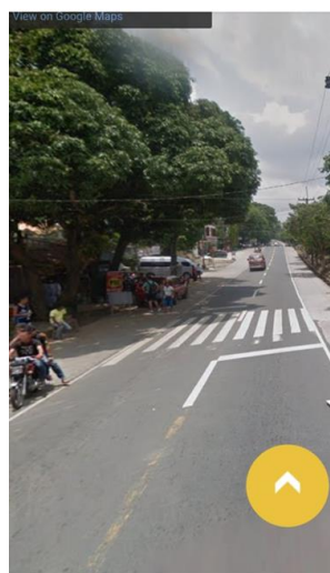
Figure 3: The Crosswalk is not contrasting in color and needs to be repaint fading is evident

Other view is the lack of handrails in which this has been one of the problems that is always overlook at when it comes to inclusive tourism the purpose of handrail and railing in which it could provide support to tourist with special needs because they have something to hold onto.