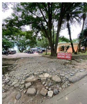
Figure 7: The main issue presented is the condition of the motor parking which had a lot of cracks

The table above shows the result of the parking when it comes to the inclusive tourism the result shows that the Picnic Grove does not follows the Parking Standard due to the lack of markings for the cars to park which can cause confusion among tourist coming to Picnic Grove on where they should park their car aside from that one of the issue present is the condition of the motorcycle parking although there is a sign for parking of motorcycle the bumps and cracks are present in the parking which makes it less safe.